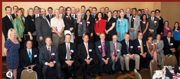
4: Volunteers were recognized at the Common Good event