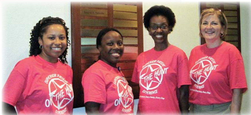
A Healthy Kids Express team visits LSEM

Approximately ten different teams from the asthma program visited LSEM to learn more about the services we provide in the community.