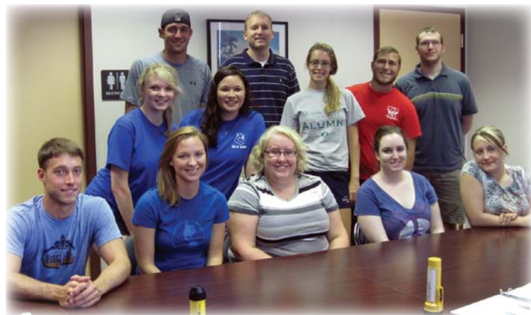
Saint Louis University School of Law students perform community service at LSEM

Twelve students from Saint Louis University School of Law came to LSEM August 13 to perform community service prior to the start of the fall semester. They assisted with filing, copying and mailing projects, as well as updating a computer inventory. LSEM is grateful for their willingness to help out with these tasks.