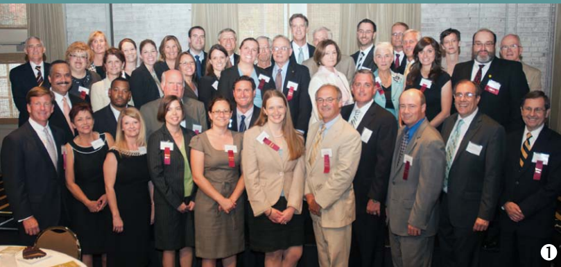
1: Volunteers and staff at the For the Common Good event